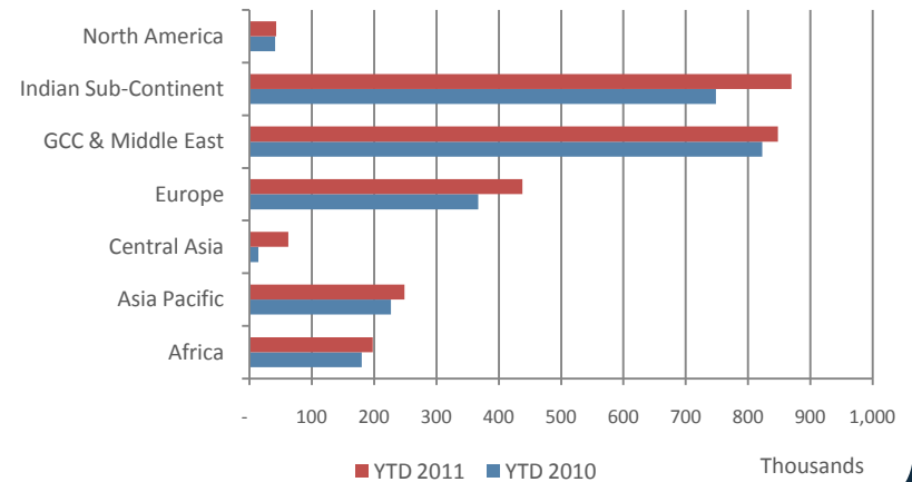
O&D by Region YTD